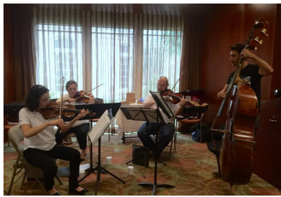
The LPO Soul Strings For Seniors: Musical Memories Program continues to engage our memory care residents.

Father's Day as a loving way to lend your support in memory of or in honor of a loved one. Your gifts support key programming including the "I'm Still Here"™ Montessori Memory Care Program, Artful Minds at NOMA, the LPO Soul Strings for Seniors: Musical