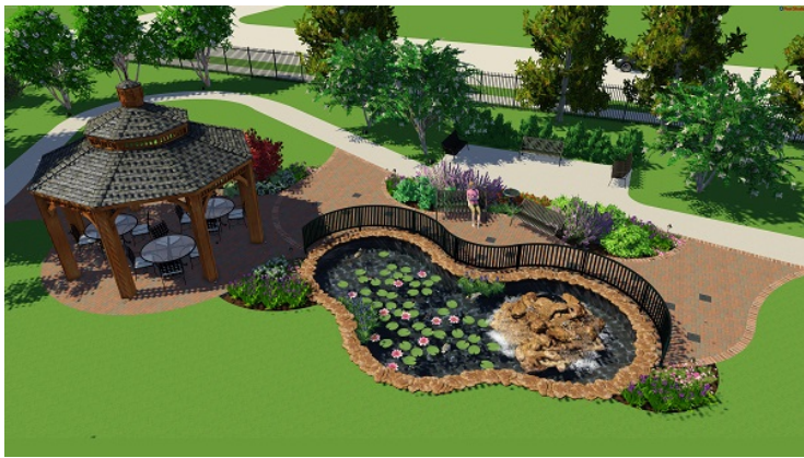
Architectural rendering by Louisiana Landscape Specialty, Inc. of Poydras Home's plans for a new park, pond and gazebo

In commemoration of this celebratory bicentennial year, Poydras Home is giving our residents a scenic park with a Koi fish pond, fountain, patio, walkways, gardens and gazebo. Current and future generations of Poydras Home residents, families, friends, visitors, volunteers and staff can enjoy this beautiful addition as they visit with loved ones, rest, repose, reminisce, reflect and return day after day to enjoy all the beauty of nature at Poydras Home. This new feature will be located on the front lawn of Poydras Home in the lower quadrant near the intersection of Magazine Street and Jefferson Avenue.