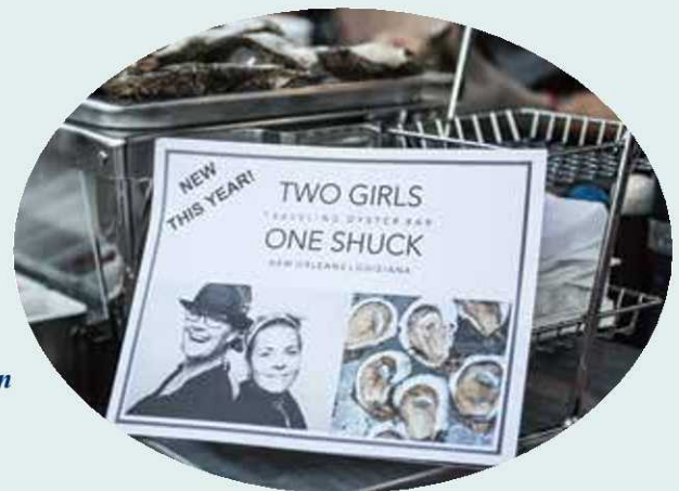
Raw Oyster Bar by Two Girls One Shuck