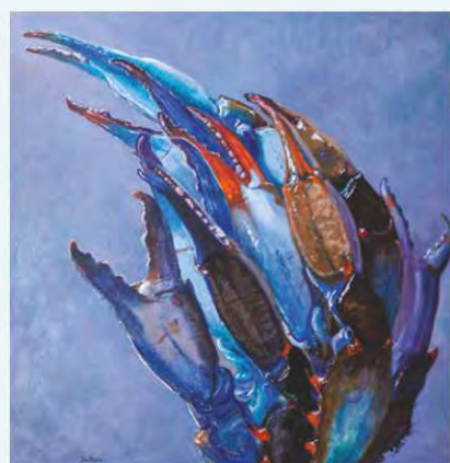
'Crab Claw Bouquet III' Artist Billy Solitario